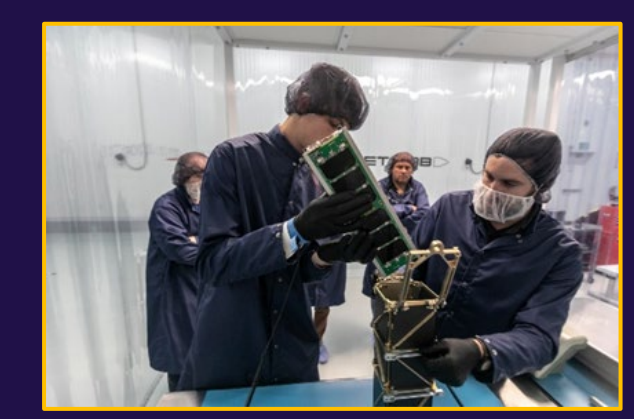
Midn-built CubeSat loading for launch